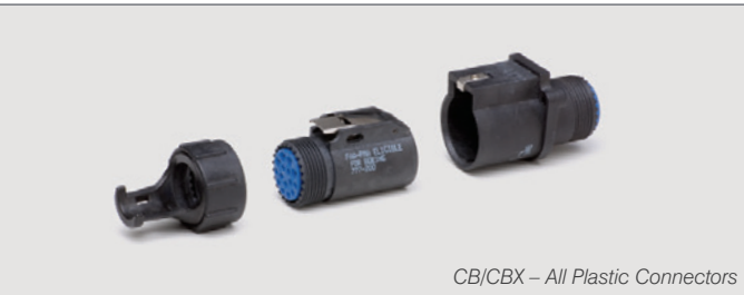
CB/CBX – All Plastic Connectors

The CQ Connector's unique design emits an audible click when mated. It is ideal for blind-mating applications and hard-to-reach places, such as under passenger seats. It mates with any standard D-Subminiature or MIL-C-24308 connector, when lockpost hardware is installed.