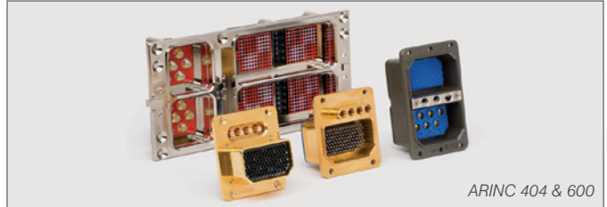
ARINC 404 & 600

Our ARINC Connector capabilities range from standard to complex with custom inserts, filtering, and harnessing options available – we do it all. Please contact our Kent, WA facility at 1 (800) 227-5953 for more information.