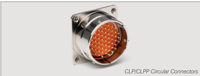
CLP/CLPP Circular Connectors

Our CBC/Galley Connectors are used by the airframe OMS, galley, and galley insert module suppliers. They have been standardized for ease of maintenance and interchangeability, and are designed to accommodate the many different plug-in warming devices and other ancillary units presently in use world-wide.