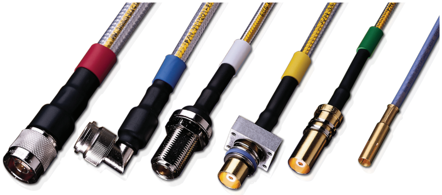
Left to Right: 310801 to N Plug; 311201 to TNC 90 Plug; 311501 to N Bulkhead Jack; 311601 to Size 1; 352001 to Modified Size 1; 3C058A to Size 5